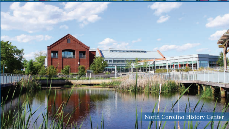
North Carolina History Center