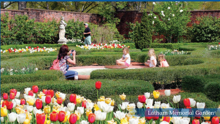
Latham Memorial Garden