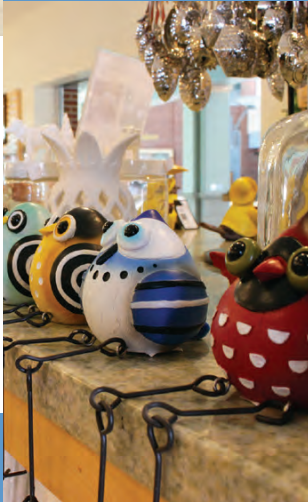
SHOPPING & DINING

Then take your imagination on an inspirational journey across the 18th and 19th centuries with visits to our collection of historic New Bern homes. Visit the Stanly House, where George Washington slept during his visit to New Bern, be amazed by the architecture of 19th-century homes like the Dixon and Hay houses, or visit the New Bern Academy Museum to see our Civil War exhibit. Please keep in mind that some historic homes and buildings are only open during special events, so please call ahead for availability.