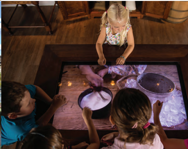
NORTH CAROLINA HISTORY CENTER

Colonial history intersects with the 21st century at every turn inside the North Carolina History Center – home to the Regional History Museum and the Pepsi Family Center. Walk among legends and artifacts as you read a letter penned by our nation's first president or travel back in time for an interactive look at New Bern in the 1830s. Once you've sharpened your skills as a quilter, printer, ship's captain, and cook, make time to join us for featured exhibits in the Duffy Gallery or plan your trip around one of the many live performances held in Cullman Performance Hall.