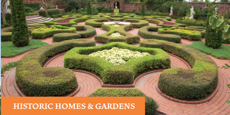
HISTORIC HOMES & GARDENS

Step into a glorious new world with every season by exploring our magnificent gardens and landscapes. Find inspiration and beauty as you enjoy our stunning period gardens, formal gardens, allées, and our kitchen garden.